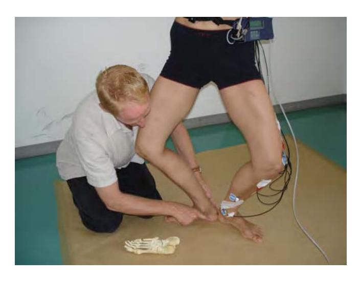
Figure 5 Indicating the direction of force in first position.

Before initiating the actual bend (plié) of the knees, the force being sent through the back of the heel has to be such that the hamstring muscles moderately engage (Fig. 5). Once engaged, the plié movement can follow its course while keeping the direction of the force going back and down out of the heel. It is recommended to practice this initially with students standing in sixth position, so they can understand the lower and backward movement; also,