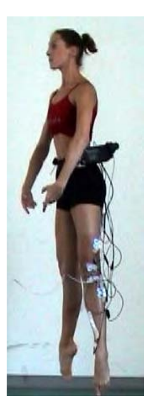
Figure 7 A dancer jumping following the correction during our research with the measuring equipment attached to her legs and spine.

This paper is adapted from: Couillandre A, Lewton-Brain P; Portero P. Exploring the effects of kinesiological awareness and mental imagery on movement intention in performance of demi-plié. J Dance Med Sci.2008;12(3):91-8.