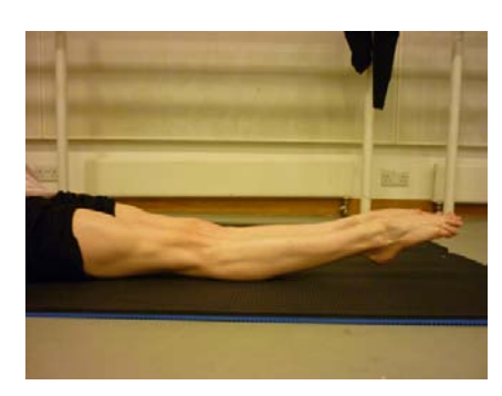
Figure 4 Hyperextension of the knees.