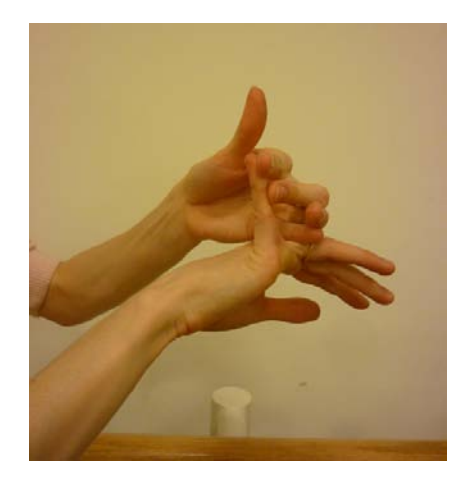
Figure 2 Hyperextension of fifth finger.