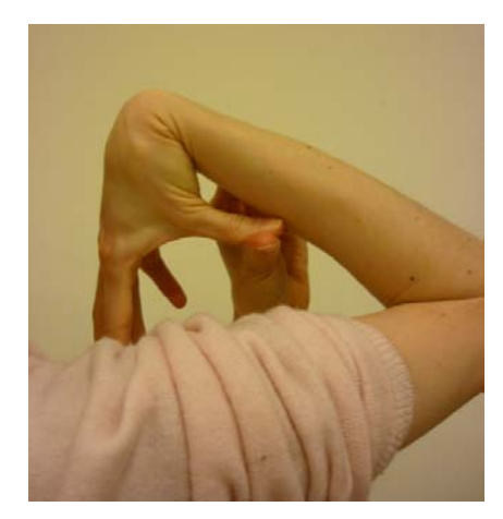
Figure 1 Thumb touches forearm.