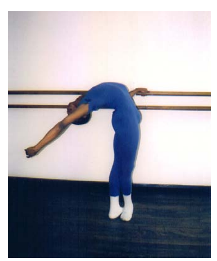
Figure 8 Hypermobile spine.

tem of position, movement, and rate of movement. The stretchiness of hypermobile tissue is thought to render this proprioceptive feedback system less efficient. Young dancers tend to need more training that is paced slowly, to instil good posture and alignment throughout the body. Attention needs to be paid to the deeper stabilizing muscles that support the joints of the spine, shoulders, hips and feet. They need longer warm ups too, indicative of a slower