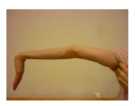
Figure 3 Hyperextension of the elbow.