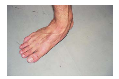
Figure 6 Pronating foot.