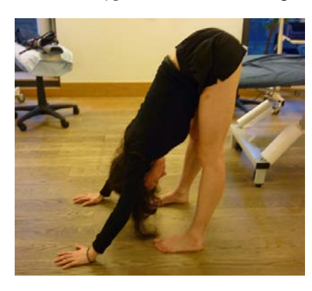
Figure 5 Hands flat on floor.