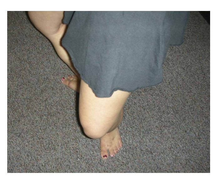
Figure 5 Dancer A with 47° hip external rotation and 45° external tibial torsion in plié. The knee will not go over the second toe unless the toes are pulled inward—and the foot is supinated.