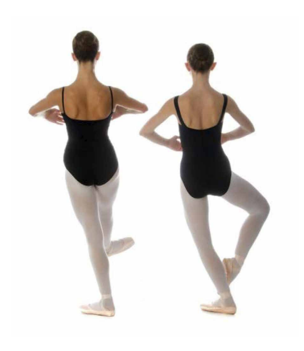
Figure 5 Standing stabilizers in battements fondus.

can be done against a wall as well, or use of a foam roller.