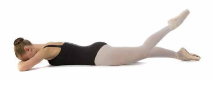
Figure 3 Prone position supporting head on arms with abdominals engaged.

Using a 2.5-inch plastic or dense rubber ball and lying with the ball under the hip, roll the ball everywhere from sacrum, around sides of pelvis and middle lower buttocks. Stop at areas of "knotty" pain until the muscle relaxes. This