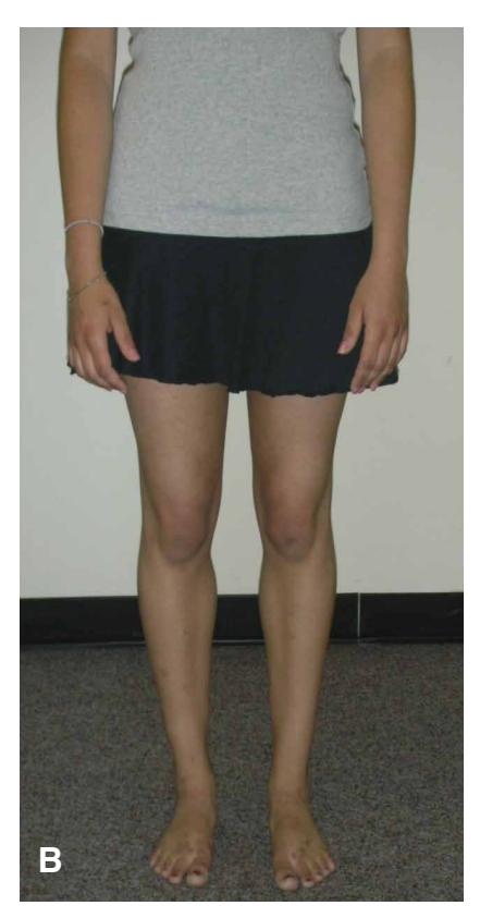
Figure 6 A , Dancer A with normal stance: Knee caps are facing forward and the toes are facing outward. The right hip has 46° and the left hip has 47° of external rotation. The right tibia has 48° and the left tibia has 45° of external tibal torsion. B , Dancer A standing in a true parallel. Notice the hips are turned in and the knee caps must face inward for the toes to point forward.