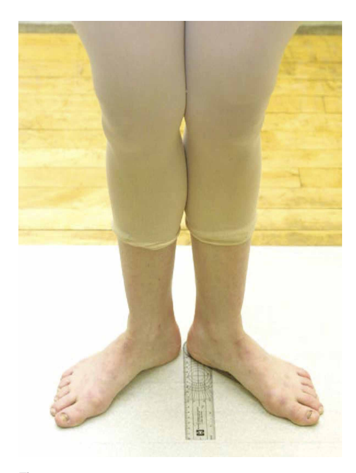
Figure 3 Total active turnout (TAT).

turnout unless the dancers are compensating. Common compensations are forcing turnout with excessive pronation of the foot and tipping the pelvis forward in anterior tilt to decrease tension on the Y ligament of Bigelow. The Y ligament is the strongest ligament in the body. It is intertwined with the front of the hip's joint capsule. It restricts hip extension and lateral rotation. The more you turnout or extend the hip the tighter the Y ligament gets. The reason we commonly see anterior pelvic tilt in dance class