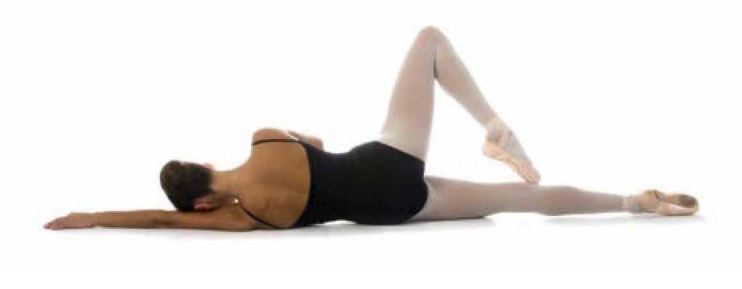
Figure 1 Correct side-lying posture with supported waist and hip-on-hip placement.