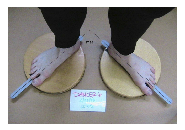
Figure 1 Total active turnout measurements were made following daily technique classes. Dancers stood on friction-reducing disks to offer their "best turnout" while maintaining neutral alignment at the feet and pelvis. The researcher later used an online graphics tool to measure the angle between the bottoms on the dancers' feet (center of each heel to the base of the second toe). The marks on the dancers' feet do not appear to align with the lines on the steel strips due to a small parallax effect.

per day, four days a week, for nine consecutive weeks. The measurements were made immediately following three hours of morning technique classes. Thirty-five measurements were made for each dancer over the nine weeks the study was being conducted.