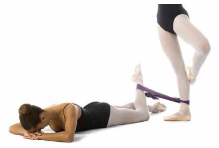
Figure 2 Theraband band resistance exercise in partners.

specifically, a participant progressed when she was observed to be consistently executing an exercise proficiently in terms of placement and alignment. Not every exercise was included in each session. In the actual study, this 45-minute session was delivered for 7 weeks, 3 times per week.