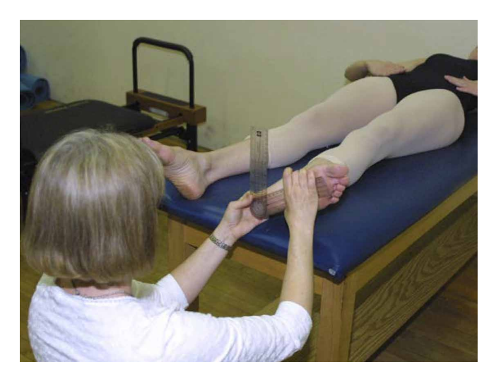
Figure 2 Measuring total passive turnout.

We found whole leg turnout (hip rotation summed with tibial torsion) ranged between 69° to 100° on the right and 70° to 99° on the left (Table 3). That does not include the foot which can add an additional 5° to 15°. Therefore the