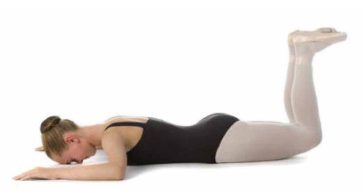
Figure 4 Prone position with arms abducted to 90° and palms facing the floor.