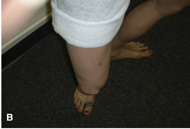
Figure 7 A, Dancer B in plié with 53° of hip rotation and 30° of external tibial torsion on the left leg. B , Dancer B with 9 more degrees (39°) of external tibial torsion on the right leg. Hip external rotation is the same as the left side. Notice the right knee is not over the second toe as well as the left knee.

10. The hip and tibial bony structure is fixed and cannot be changed. For this reason, dancers who have assymetric turnout because of differences in hip rotation or tibial torsion should use the less turned out leg as a guide for best practice. Note that there are other causes of assymetry, such a differences in strength (Fig. 7b).