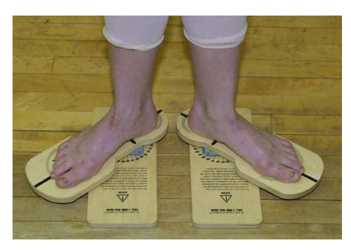
Figure 4 Turnout on rotational disks.

turnout unless the dancers are compensating. Common compensations are forcing turnout with excessive pronation of the foot and tipping the pelvis forward in anterior tilt to decrease tension on the Y ligament of Bigelow. The Y ligament is the strongest ligament in the body. It is intertwined with the front of the hip's joint capsule. It restricts hip extension and lateral rotation. The more you turnout or extend the hip the tighter the Y ligament gets. The reason we commonly see anterior pelvic tilt in dance class